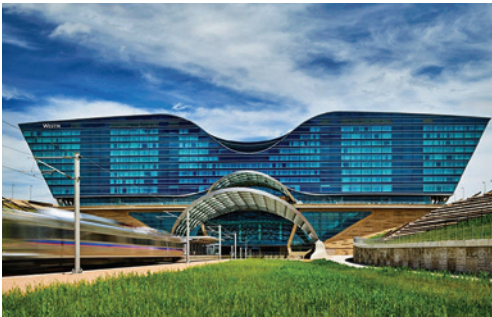
Figure 3: Denver International Hotel & Transit Center in Denver used complex mix designs including high strength, self-consolidating and lightweight concrete for the transit and hotel canopy abutments, the hotel ballroom's transfer beams and slab and the structure's sloping roof deck. Many of the walls and columns within the structure are "architecturally exposed," requiring a clean and attractive finish. Beyond being able to fulfill the project's design challenges, builders chose concrete for its fire resistance and strength.

7. Quantity of SCM: Some specifications place limits on the quantity of SCMs. Often, the use of more than one type of SCM is prohibited. This prevents optimizing concrete mixtures for performance and durability. The only building code restriction is for exterior concrete subject to application of deicing chemicals. Maximum limits on the quantity of SCM increases cost and does not support sustainable development. Increasingly, projects seeking green certification impose prescriptive requirements on concrete mixtures such as minimum replacement for cement or minimum recycled content. These requirements can often impact the performance of fresh and hardened concrete properties, such as setting characteristics, ability to place and finish and rate of development of in-place properties. In the long run, this may impact the quality of construction or the service life of the structure. The implication to initial cost may be reduced, but it could cost more in the long term. Alternatives to limiting quantities of SCM to lower environmental impact are discussed later.