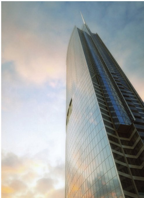
Figure 2: Standing at 1,100 feet tall, the Wilshire Grand Center in Los Angeles is the tallest building west of the Mississippi. The building uses a mixed concrete and steel structural system consisting of composite concrete and steel floors that span from an internal concrete core to perimeter concrete-filled steel box columns. Concrete for the 18-foot thick mat foundation was kept cool by circulating chilled water through 90,000 feet of polypropylene hoses that were eventually filled with grout.

The intended concrete performance can be attained without specifying prescriptive requirements. The following is a detailed discussion of how prescriptive criteria listed in Table 1 can influence performance and sustainability of concrete.