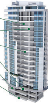
Figure 5. Specified compressive strength of concrete for an 18-story residential tower.

The first step in the analysis is to identify typical concrete mixtures for the reference building. One organization publishes benchmark mix designs and their environmental impacts for eight different regions in the United States. This example uses the benchmark mix designs for the Northeast region.