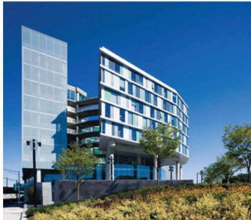
Figure 8: The Gateway, Maryland Institute College of Art, Baltimore uses concrete to form distinctive circular structures sectioned into three pods of residential units surrounding a private central courtyard. The round shape of the residential wing, one of the building's central features, was formed by a faceted cylinder elevated on slender concrete columns. Concrete balconies and walkways ring the interior of the hollow residential wing, providing for basic circulation as well as vantage points for watching outdoor performances in the courtyard. The flexibility of concrete is on full display in the drum shape of the residential wing. Concrete structural slabs create the support the building needs to achieve its unique design.

peak heating and cooling loads allowing for smaller more efficient heating and cooling equipment. And third, massive buildings require less overall heating and cooling energy to maintain the same interior temperatures since temperature swings are moderated.