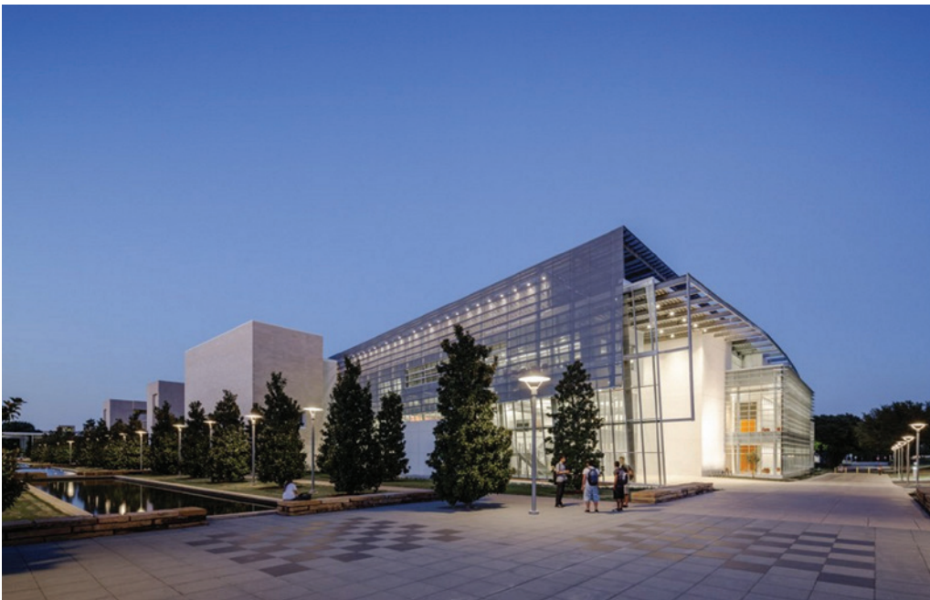
Figure 6: Edith O'Donnell Arts & Technology Building, University of Texas, Dallas, uses a partially exposed concrete structure to take advantage of concrete's thermal mass properties which trap heat during cold months and keep structures cooler during warmer weather. Concrete's long life and durability is important for academic buildings that must address the needs of the university and its students for many decades. Some of the same properties that make concrete strong (its mass and rigidity) also make it virtually soundproof. The beauty of concrete is on full display in the partially exposed structure including polished concrete floors and beams in the lobby. The project achieved LEED Silver.

Constructability. Design decisions can also affect constructability. Smaller members with congested reinforcement take more time and energy and are typically more costly to construct. A project specification that requires a minimum quantity of fly ash greater than normal use could result in delayed strength gain that could add to the construction schedule since floors might not be able to be post-tensioned within a reasonable time frame or a bridge deck might not be able to open to traffic without significant delays. A