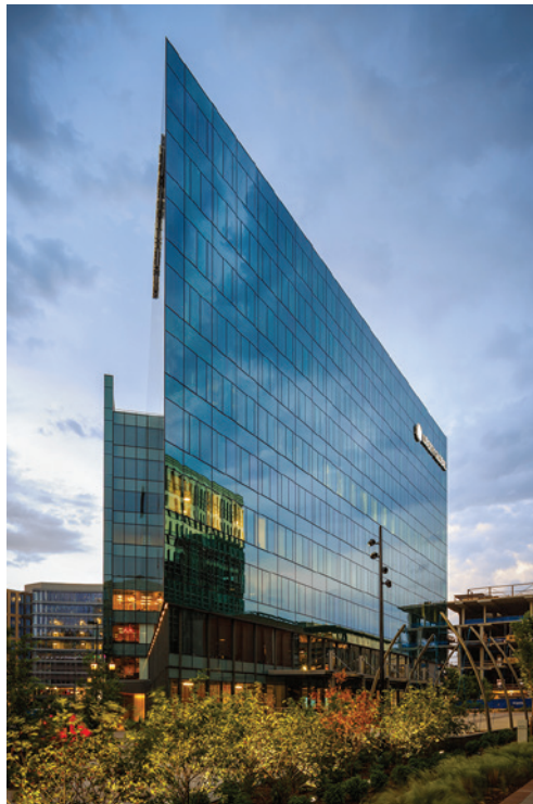
Figure 4: The Triangle Building in Denver used fifteen types of concrete including shotcrete, cast-in-place, high strength and lightweight concrete. Each variety serves a particular purpose and contributes to the building's LEED Gold Certification.

*Values are for example only. Each project would require a different set of criteria.